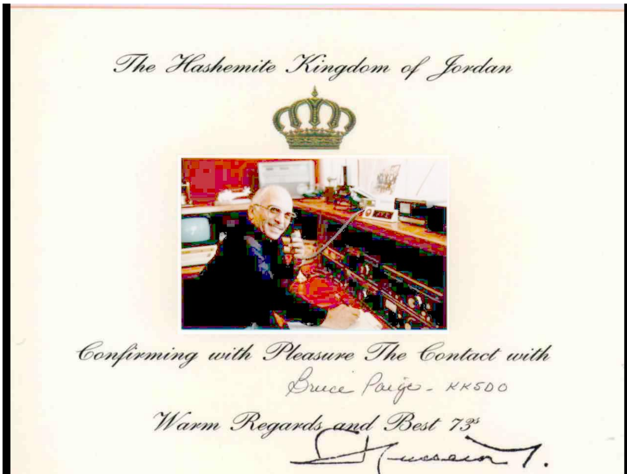
QSL Card from King Hussein (SK) of Jordan to Bruce, KK5DO

Nationwide car-to-car: I TAC 1 866.0125 I TAC 2 866.5125