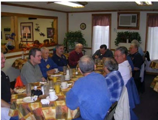
Part of "The Gang"