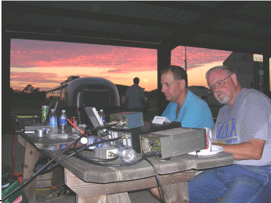
The 20M SSB station at sunset.

Field Day was well attended and enjoyed by all. All regular bands from 2M through 80M were used. Modes included SSB, CW, FM, PSK-31, APRS & Satellite (see related article herein). As usual, Allen Brier, N5XZ, made more points than everyone else combined working primarily 20M CW. Food was continuously available, with a sandwich lunch provided mid-day on Saturday, and again on Sunday and of course the primary feed was Saturday evening with a savoring Bar-B-Que of chicken, hamburgers, hot dogs and sausage. About 40 members and guests enjoyed the meal. Visiting dignitaries included Ft. Bend County Sheriff Milton Wright and the Assistant Emergency Coordinator Ft. Bend County, Danny Jan.