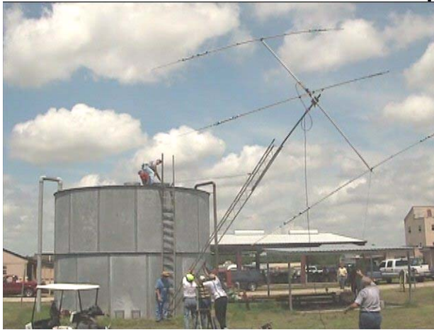
Up baby, up!!!