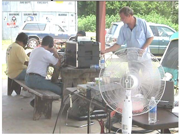
The two VHF stations