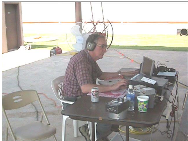
N5XZ, beware of K5IZO

The Brazos Valley Amateur Radio Club extends it's sincere THANK YOU to the Richmond Fire Department for allowing use of it's Fireman's Training Center for Field Day.