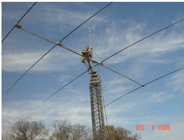
Securing & adjusting the beam