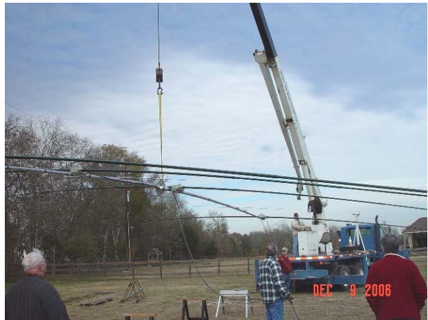
Up with the beam