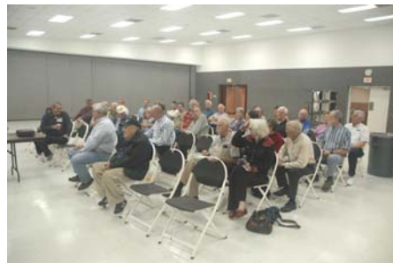
I want to EAT!