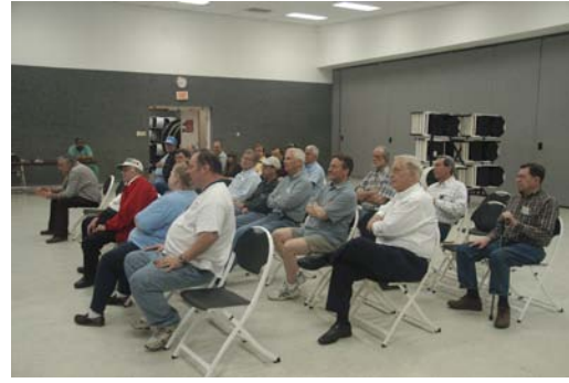
Pics from April meeting