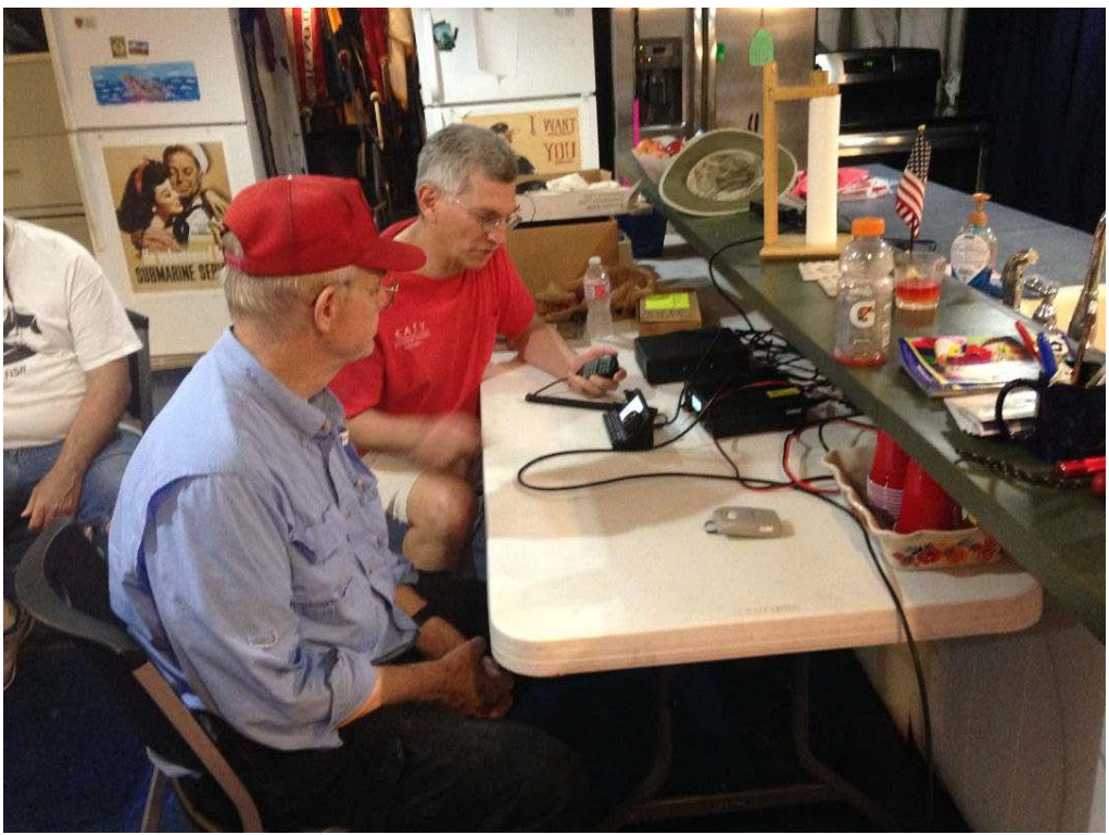
One of 3 operating stations

We're developing a lessons learned and wish list for next year. These include a better way to route the transmission lines so they don't get crimped in the hatch door. Getting the logging computers squared away earlier and more elmering for operational consistency. Given the success of the vertical antenna – we'll seek to put a larger vertical on the deck at the stern. There are several significant items we'll want to work on for the next event, including getting the Cavalla's antennas in ship shape condition.