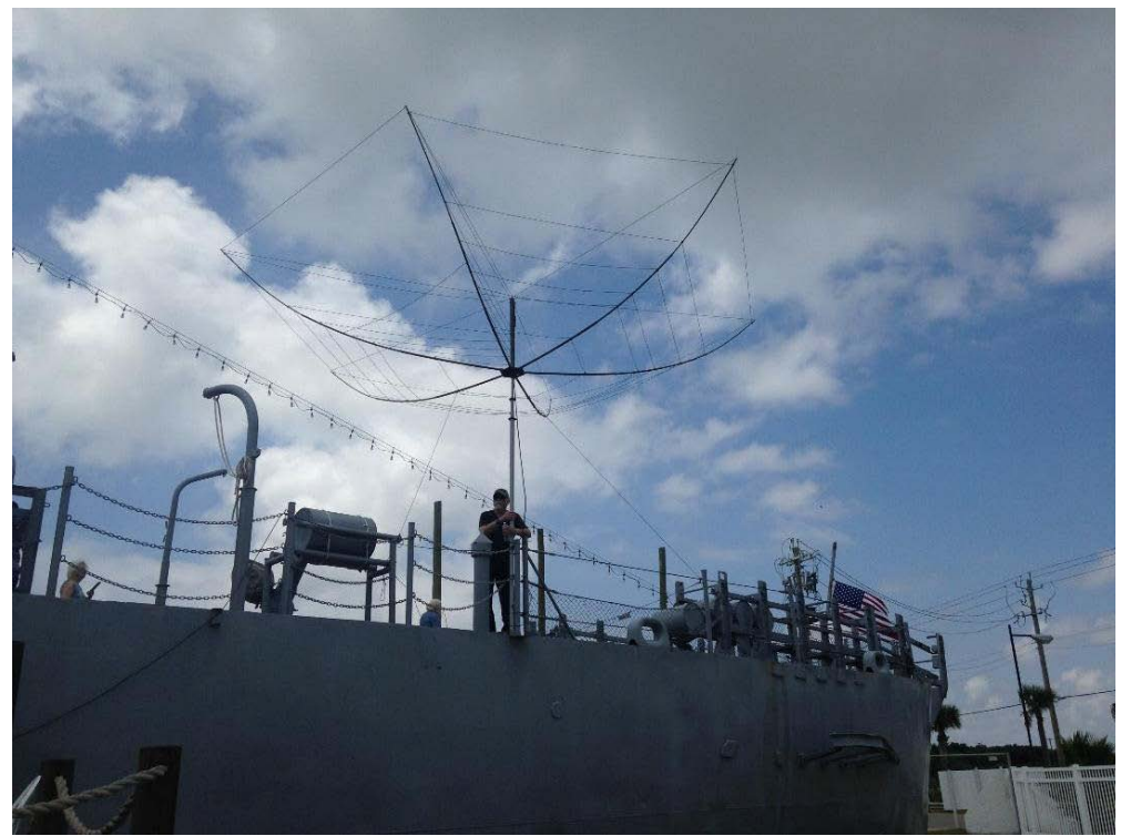
Setting up the spider beam