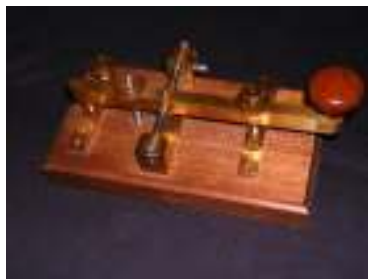
British P.O. High-Knob Key