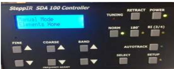
Pic 3 -- Control Unit Front Panel