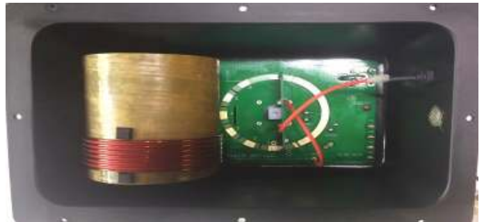
Pic 4 -- 40 Mx Loading Coil Add-on