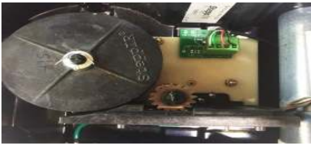
Pic 2 -- Main Control Unit with Cu tape reel

meters thru 6 meters with automatic fiberglass vertical tube inside of which moves and sprocket wheel in the base unit (Pic 2). control unit (Pic 3). 40 meters is added to the of a base loading coil contained in a separate series with the main vertical system. Radials