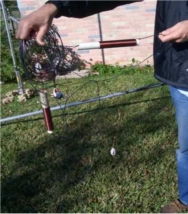
1) The Loading Coils