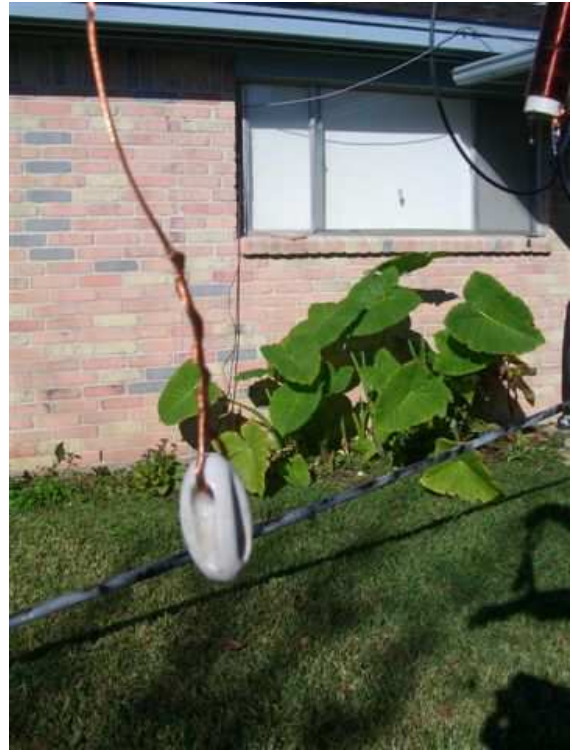
2) End Insulator