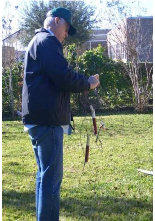
4) Doing the “detangle”