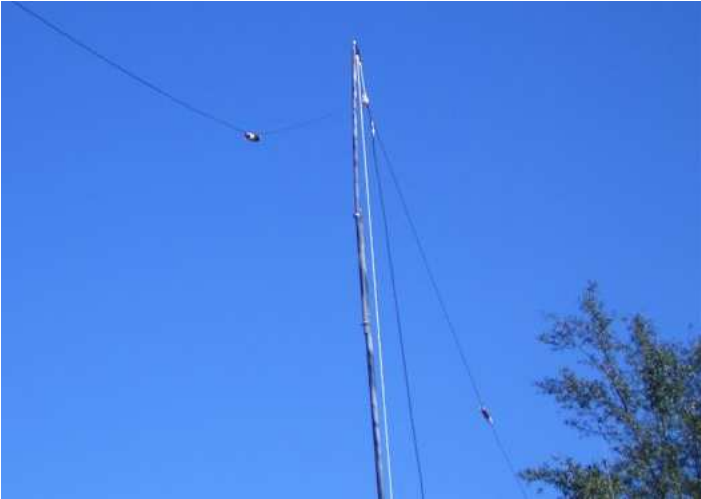
Center Support Mast – 25 feet