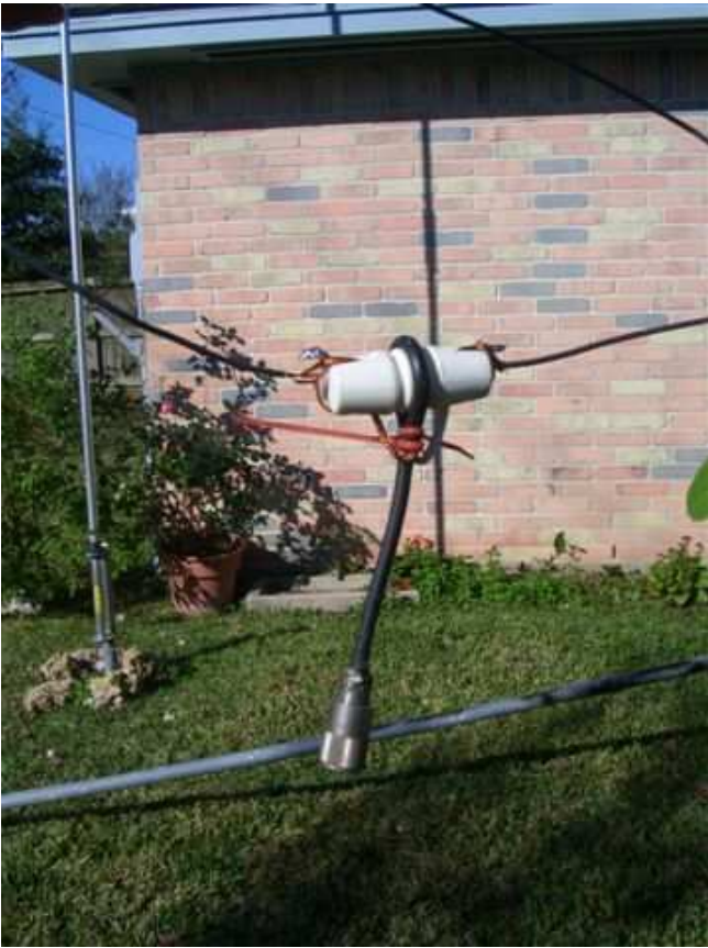
3) The Feed Point